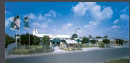
Silikal production and administration in Mainhausen, near Frankfurt/Main, Germany.

Contact us. We would be pleased to go into detail with you – at no cost or obligation to you, of course.